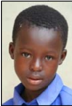
Famous (08015) Age 12 – Band 2