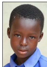
Famous (08015) Age 10½ – Band 2