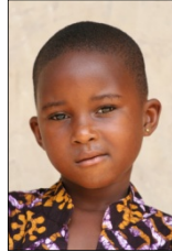
Ameley (08002) Age 8½ – Band 1