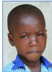
Prince (08024) Age 8 – Band 4